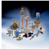
Controls for Commercial Refrigeration

We focus on our core business of making quality products, components and systems that enhance performance and reduce total life cycle costs – the key to major savings.