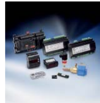
Electronic Controls & Sensors