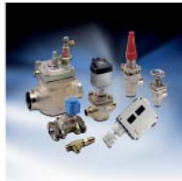
Controls for Industrial Refrigeration