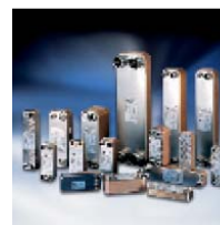
Brazen plate heat exchanger

We are offering a single source for one of the widest ranges of innovative refrigeration and air conditioning components and systems in the world. And, we back technical solutions with business solution to help your company reduce costs, streamline processes and achieve your business goals.